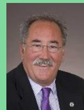
State Representative Jim O'Day

MAICEI is a program of the Massachusetts Department of Higher Education, funded by the Massachusetts Legislature (Line Item 7066-9600)